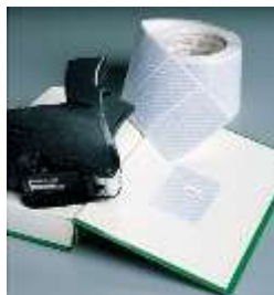
Removable Date Due Labeling Panel