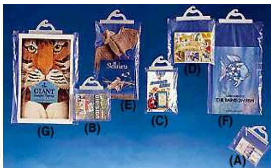
Handle adds 3 3/4" to over height